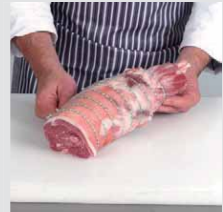
8. Carvery roast (shoulder).