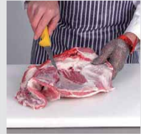
4. Remove the blade bone...