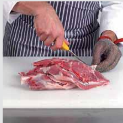
6. Trim off any excess fat.