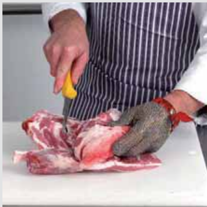
5. and humerus but leave the knuckle intact.