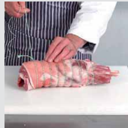
7. Roll and tie securely with string at regular intervals.