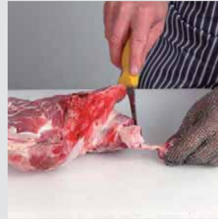
3. French trim the knuckle to expose 25mm of clean bone.