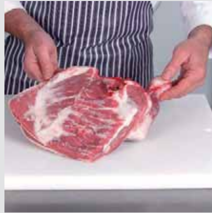
2. Shoulder of lamb.